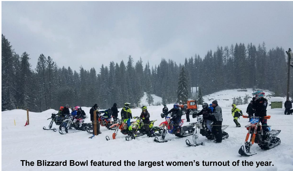
The Blizzard Bowl featured the largest women's turnout of the year.

Round 4 of the 2019 NASBA 509 National Championship Snow Bike Series will be held at the near Whitefish, Montana on February 23. Racers will be able to purchase, world-class VP race fuel at all of the remaining 2019 NASBA events, courtesy of Carl's Cycle from Boise. There are no fuel restrictions at NASBA events, so high-octane, leaded, and even oxygenated fuels can be utilized in all classes. Partners for the race were: 509 Racing, VP Race Fuel, MotoTrax, 5CR Powersports, Carl's Cycle, Excel Fabrication, Powersports Unlimited, SMSC, Main Street Motorsports, Outlaw Motorsports, Roto Rooter, Mac's Cycle, Gage Broz Motorsports, Helsor Construction, Fly Racing, Rogers Toyota, SXS, Project Filter, Yamaha, Peet Dryer, Jerm Designs, H&H Express, Seehorn Xtreme Skidplates, and EVO Idaho. Special thanks to: Mike Morey, Tina Lininger, Angi Woehler, Emma Lininger, Andrew Pace, Arnold Caines, Dawn Bristlin, Randy Johnson, Kendrick Jared, Mike Fredrick, Donna Ospreski, Kenneth Kienbaum, Riley Kienbaum, Kaden Kienbaum, Naureen Sago, Dylan Julian, Ray Amos, Robin Murphy, and Jason Marchioro. The Clarkia Blizzard Bowl round was promoted and organized by Eric Christiansen, owner of EC Enterprises, Lewiston, Idaho, and Greg Ragsdale, owner of Stix & Stones Off-Road, Spokane Valley, Washington, and was round 3 of the North American Snow Bike Association National Snow Bike Series.