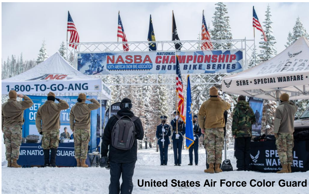
United States Air Force Color Guard