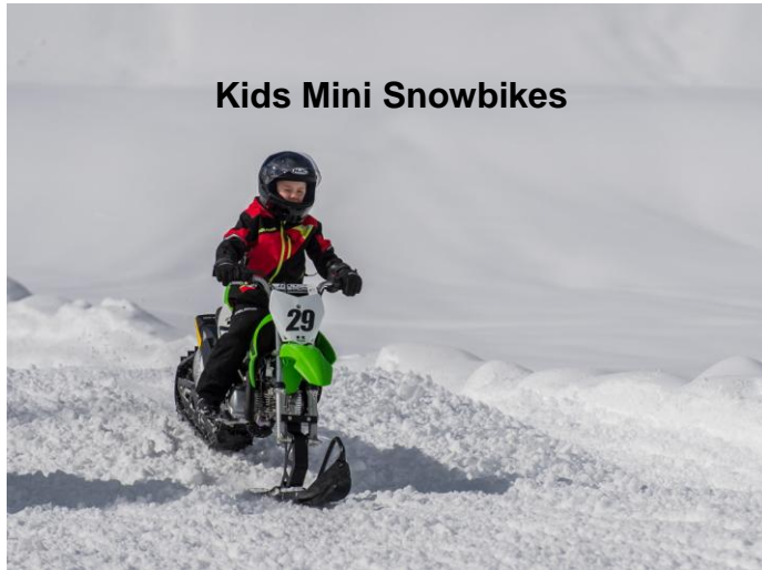
Kids Mini Snowbikes