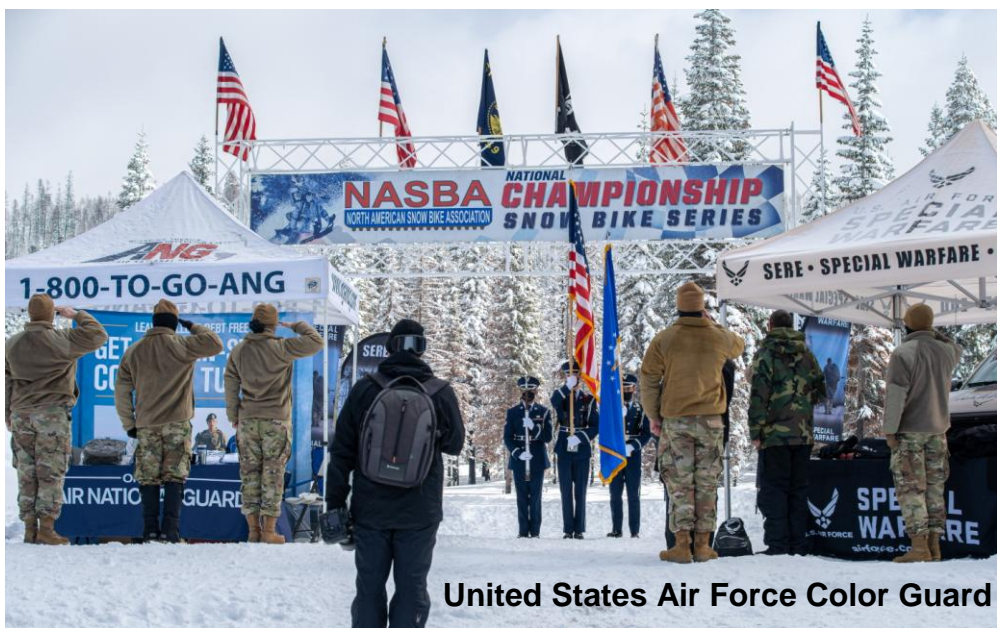
United States Air Force Color Guard