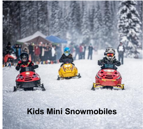
Kids Mini Snowmobiles